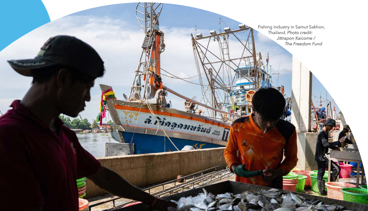
Fishing industry in Samut Sakhon, Thailand.

We also commissioned a research project to look at the impact of strategic litigation on corporate behaviour. The research, which will take place in 2023, will inform our litigation grant-making strategy and fill the evidence gap around the effectiveness of strategic litigation.